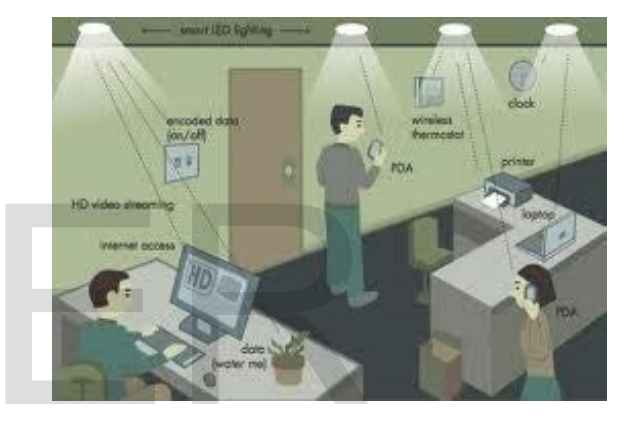
Fig.1 Li-Fi enviorment

In October 2011 a number of companies and industry groups formed the Li-Fi Consortium, to promote highspeed optical wireless systems and to overcome the limited amount of radio- based wireless spectrum available by exploiting a completely different part of the electromagnetic spectrum. The consortium believes it is possible to achieve more than 10 Gbps, theoretically allowing a high-definition film to be downloaded in 30 seconds.